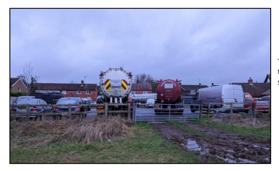
Tankers in The Plough car park used for taking away sewage from pumping station.